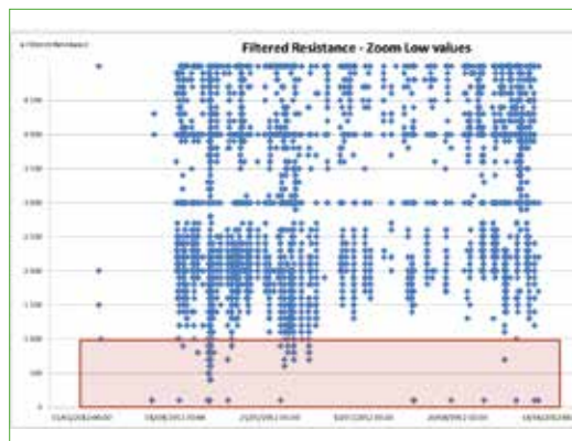
Filtered resistance: There are a few points below 1kOhm that require excellent signal processing and filtering capabilities to avoid undesired tripping.